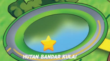
HUTAN BANDAR KULAI