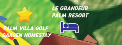
LE GRANDEUR PALM RESORT