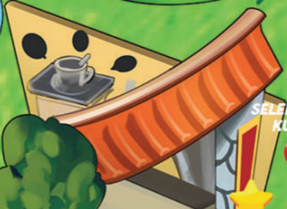
SELERA RASA KULAI