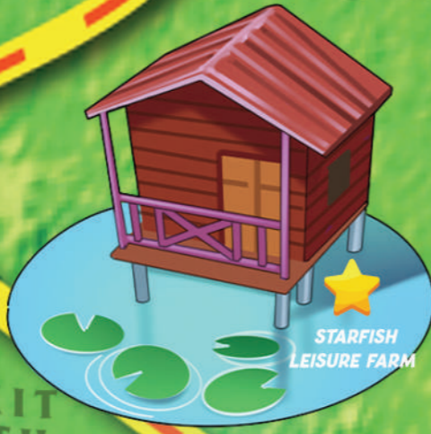
STARFISH LEISURE FARM