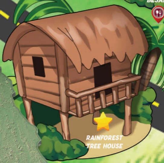
RAINFOREST TREE HOUSE